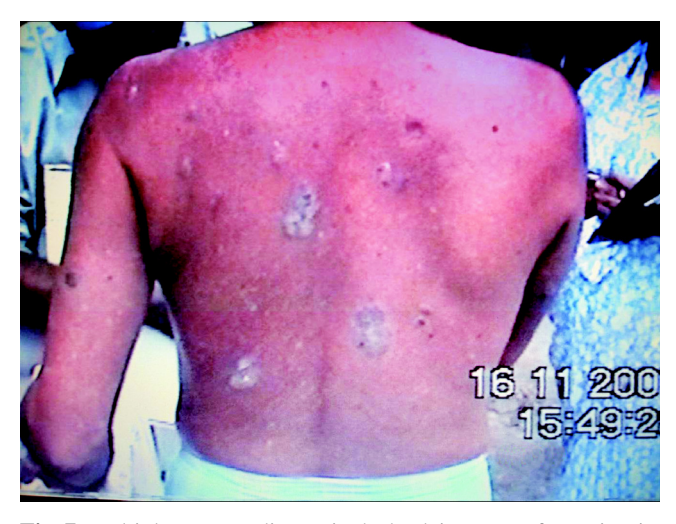
Fig. 7. Multiple Bowens disease in the back in a case of arsenicosis.

Further there is increased risk of development of urinary bladder cancer and lung cancer due to chronic exposure to arsenic. When all the epidemiological data are considered for these two cancers, the findings could not be attributed to chance or confounding<sup>4</sup> and they are consistent, with strong associations found in populations with high exposure of arsenic<sup>4</sup>. There is evidence of doseresponse relationships within exposed population. Increased risk of liver cancer has also been reported