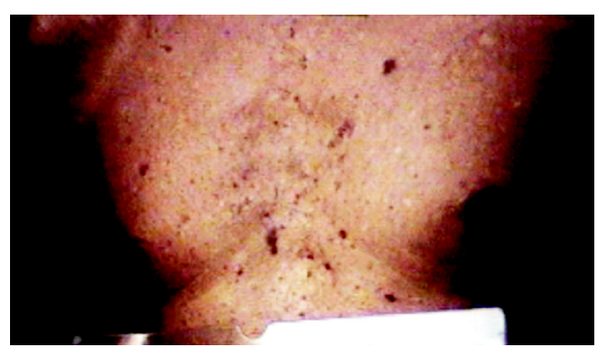
Fig. 1. Arsenical pigmentation (spotty rain drop like) affecting bilaterally over the front of the chest.

Arsenical keratosis appears as diffuse thickening involving palms and soles, alone or in combination with nodules usually symmetrically distributed. The nodular forms are encountered most frequently on the thenar and lateral borders of palms, on roots or lateral surfaces of fingers and soles, heels and toes of feet. Such small nodules may coalesce to form large verrucous lesions (Fig. 3). The nodular form may also occur in the dorsum of the hands and feet and other parts of the body (Fig. 4). In severe cases, cracks and fissures may be seen in the soles. Keratosis is further subdivided into mild, moderate and severe. Mild form appears as slight thickening or minute papules (less than 2 mm) in the palms and soles, often associated with a grit-like texture, which may be primarily detectable by palpation. Moderate forms are multiple raised keratotic lesions (2-5 mm) while severe forms are large discreate or confluent elevations (>5 mm) on palms and soles, with nodular, wart-like or horny appearance<sup>7,10</sup>. Histological examination of the lesions typically reveals hyperkeratosis with or without parakeratosis, acanthosis, and enlargement of the rete