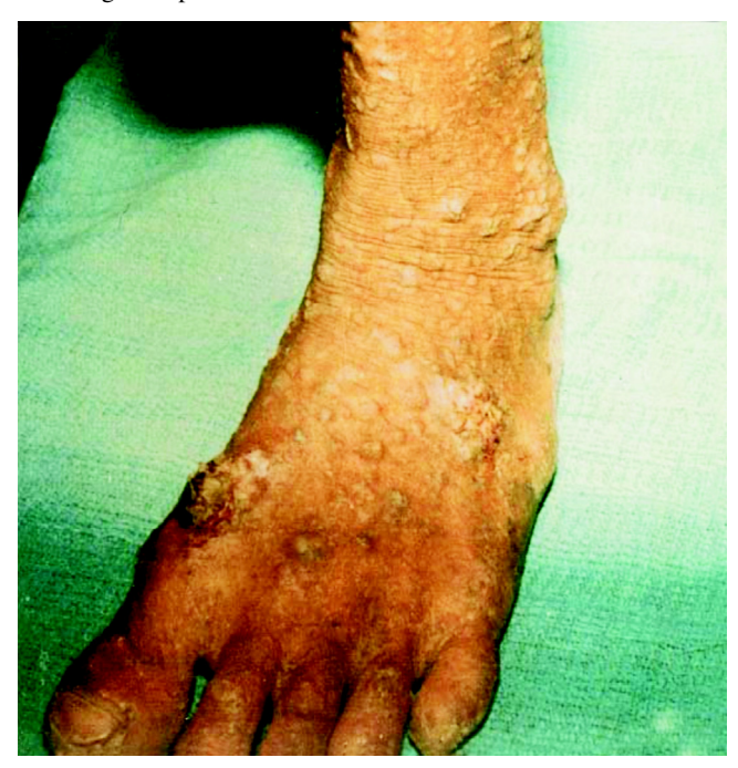
Fig. 4. Arsenical nodular keratosis involving dorsum of foot with skin cancer.

ridges. In some cases, there might be evidence of cellular atypia, mitotic figure, in large vacuolated epidermal cells<sup>11</sup>.